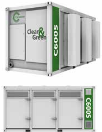
C600S Power Package