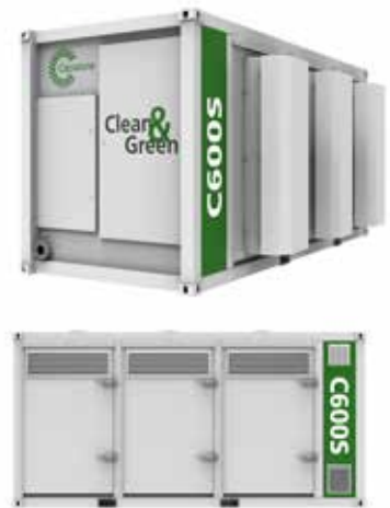
C600S Power Package